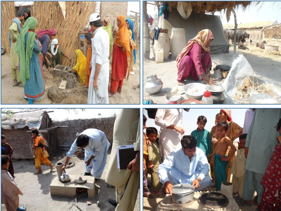
Fuel efficient stove construction